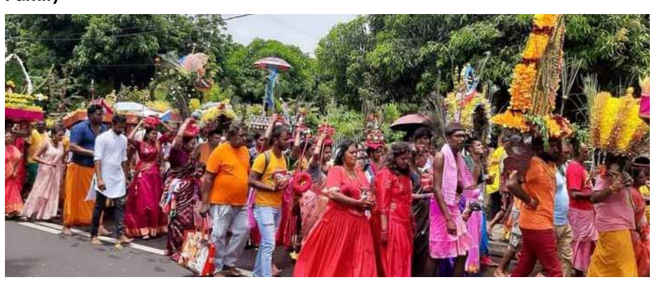
Devotees walking to the kovil with their cavadees