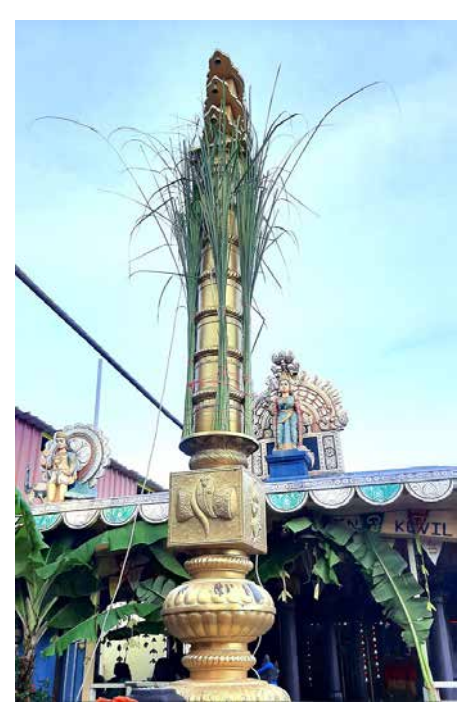
Hoisting of the flag, indicating the beginning of the fasting.