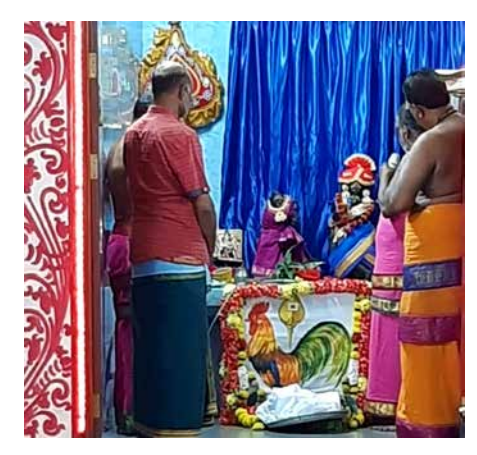
Prayer by the Priest at the Kovil