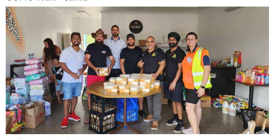
Holloways Beach First Hub