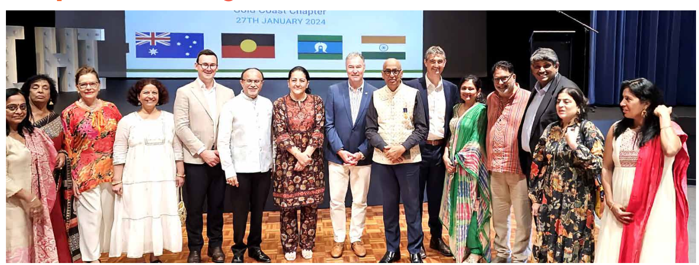
Members of GOPIO Gold Coast with representatives of GOPIO International, FICQ, The India Australia Society of Queensland and elected representatives

OPIO Gold Coast hosted the 75th Indian Republic Day celebrations on Saturday, 27th January 2024, attended by approximately 100 people from the Gold Coast and the wider Indian and multicultural Community.