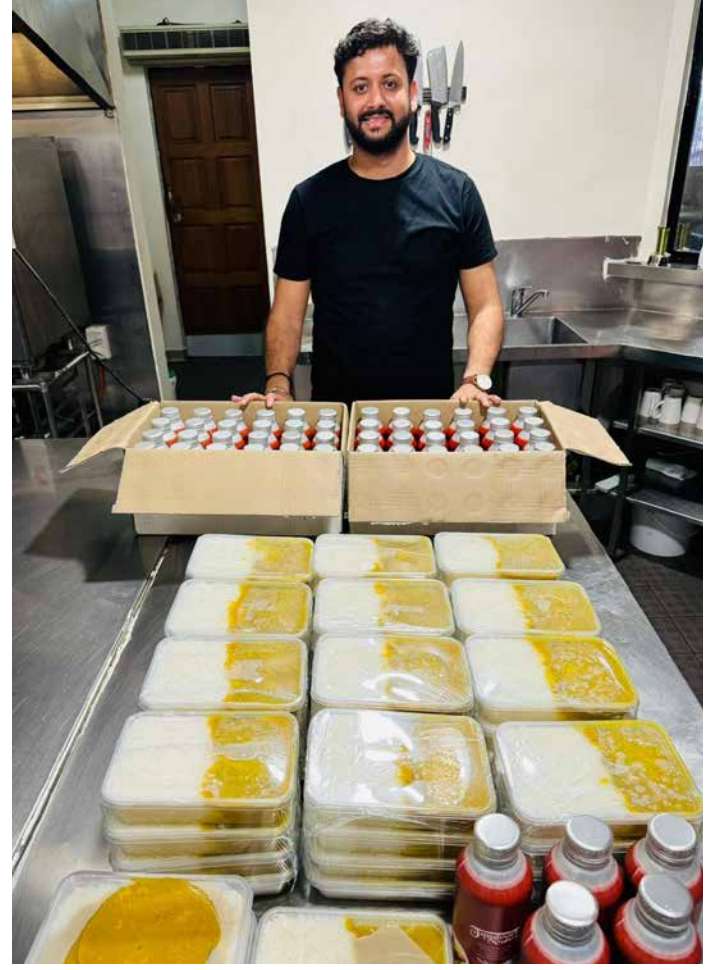
Monty - Tandoori Nights

This was only achieved by a strong team of Individuals who volunteered their time and were dedicated to supporting the community and, with their love and kindness, strong connections with local businesses and community advocates.