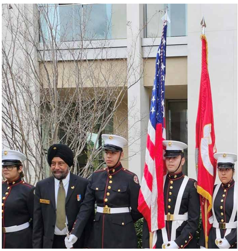
Color guard and ROTC of Orange Highschool