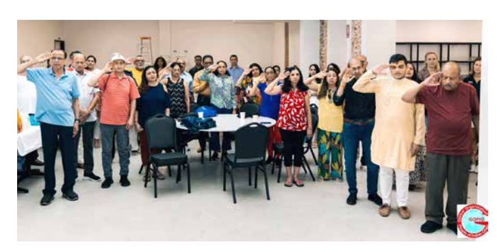
Global visit Florida to Cairns on Indian Republic Day