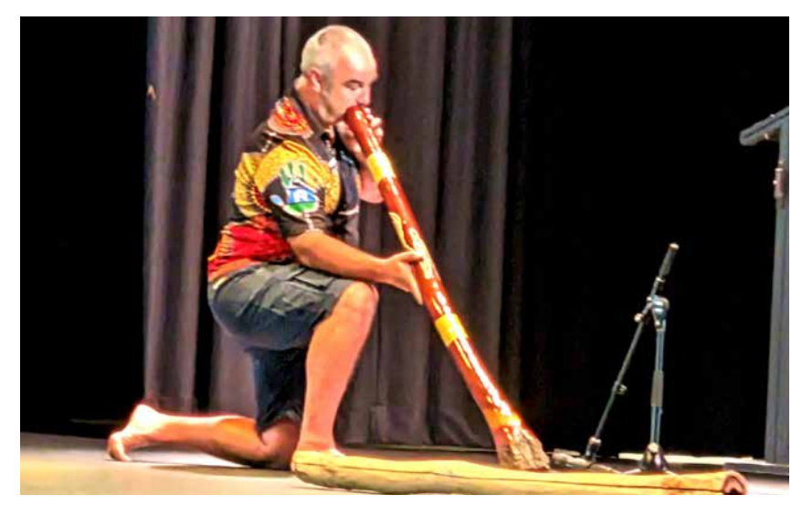
Didgeridoo performance as part of the Welcome to Country during the Citizenship Ceremony