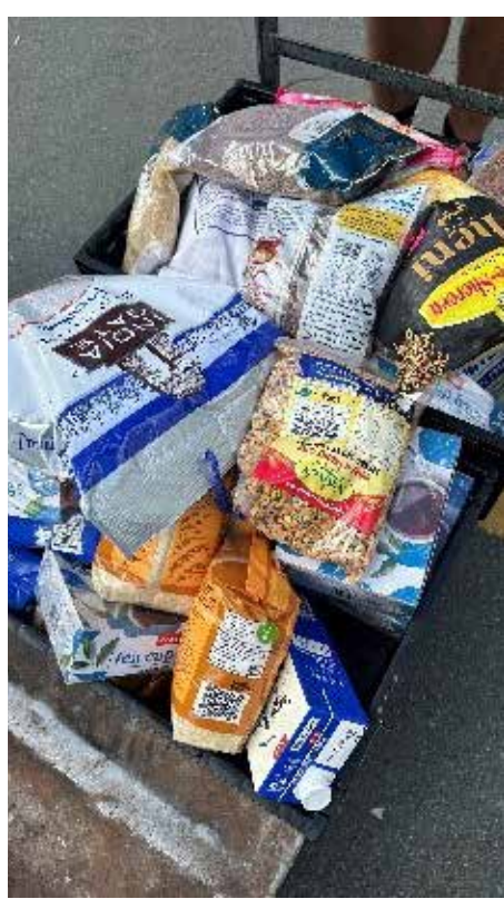
GOPIO and the MAC committee donating non-perishables item for international students' pantries to the University of Canberra. 8/2/24