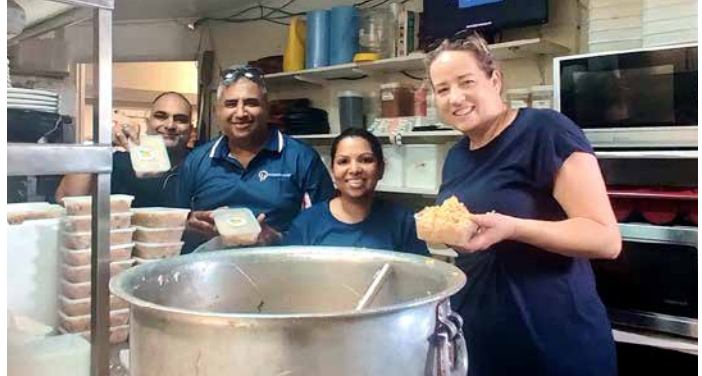
GOPIO Cairns team in action in the kitchen